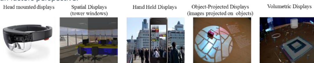
Figure 1 Augmented Reality Technologies identified for the airport control tower

A review of the current means to provide augmented reality, either through display screens or head mounted displays, was presented. A list of technologies was included addressing the benefits and drawbacks of each one as it applies to the RETINA concept. An analysis of the various technologies listed was performed to investigate the ergonomic viability and risks and benefits of each from a human factors perspective.