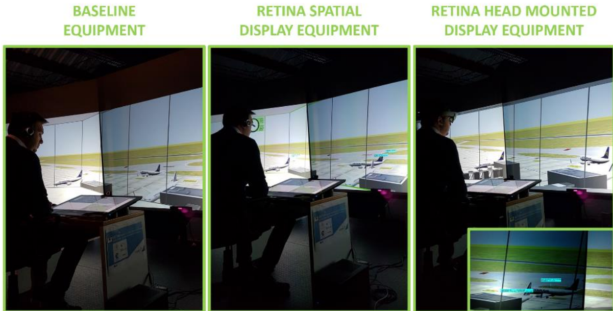
Figure 4 RETINA Validation Platform. The AR App derives the relevant Augmented Reality Overlays and deploys them on the appropriate ATCO Head-Up Interface (being either Spatial Display or Head Mounted Display). The baseline equipment serves to compare data obtained vs success criteria and validation targets identified below.

During the validation both subjective qualitative information and objective quantitative data were collected and analysed to assess the RETINA concept. In addition, a usability test was performed on a simplified validation platform.