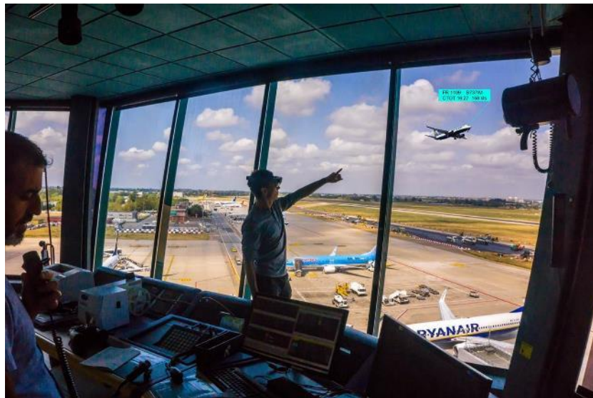
Figure 2 The RETINA concept

Finally, the conceptual solutions were described in D2.1 [2]. The document describes how the V/ARTT should fit into the control tower environment and procedures identifying when, why and how the controllers will make use of augmented visual observation in order to manage the aerodrome traffic.