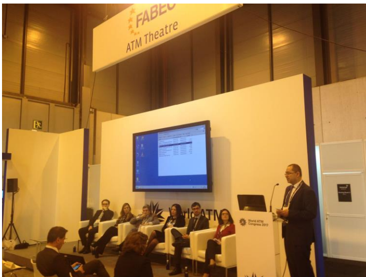
Figure 4 Workshop “RETINA and automation: a human factors perspective in ATM” during World ATM Congress 2017