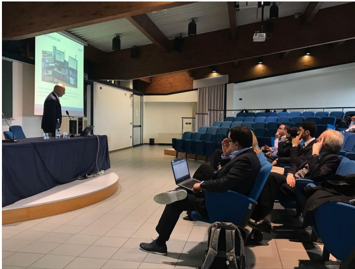
Figure 3 RETINA Demonstration Day @University of Bologna